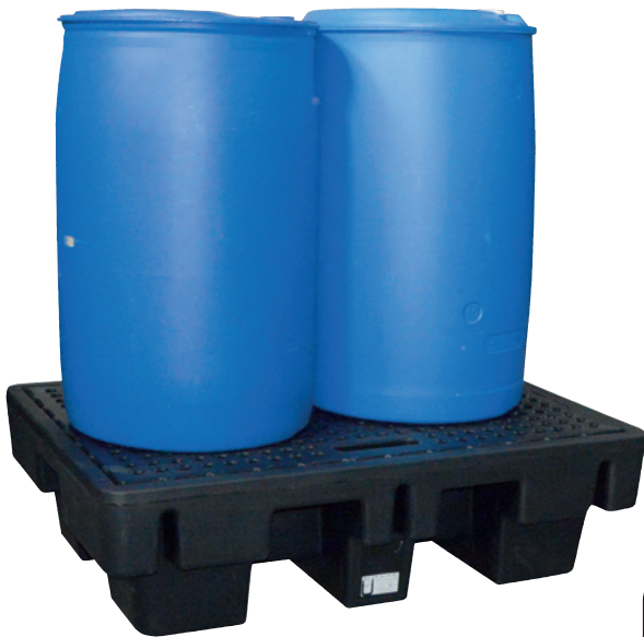
PE-200-5, with PE perforated plate, Article no. P70-2025-A