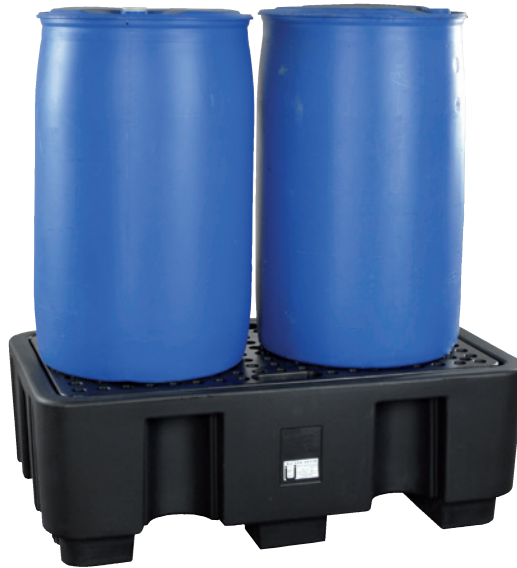
PE-200-2, with PE perforated plate, Article no. P70-2021-A