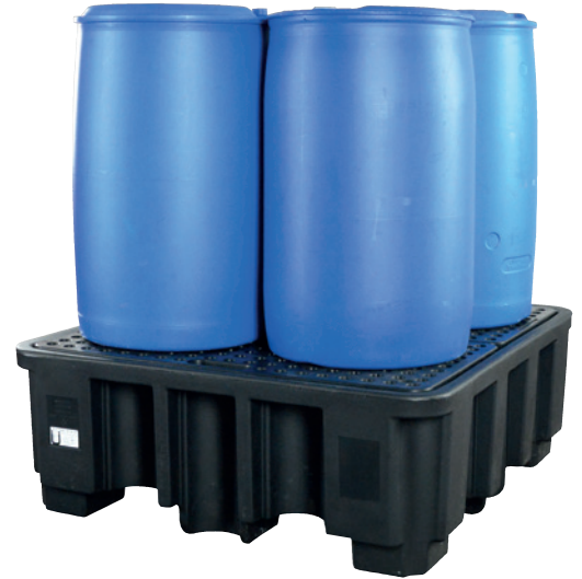
PE-200-3, with PE perforated plate, Article no. P70-2026-A