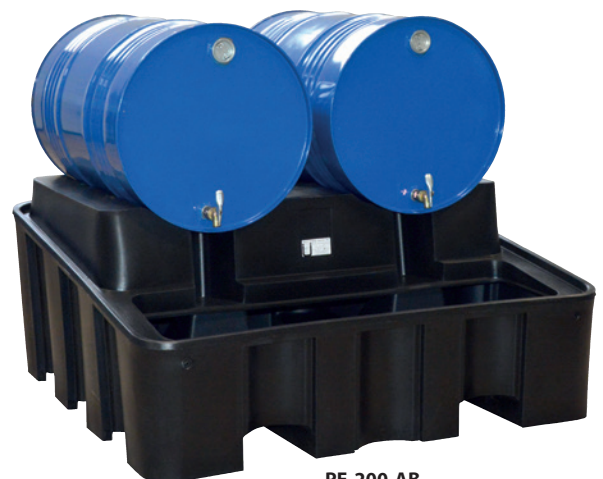
PE-200-AB, with integrated filling stand, Article no. P70-2027-A