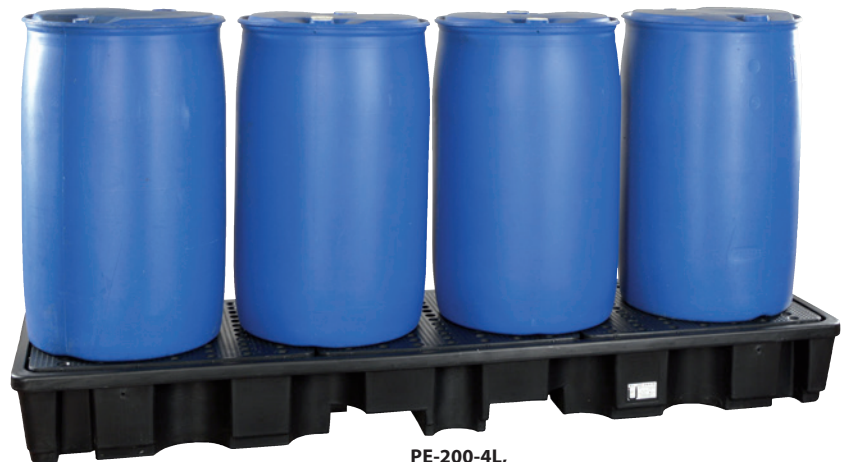
PE-200-4L, with PE perforated plate, Article no. P70-2023-A