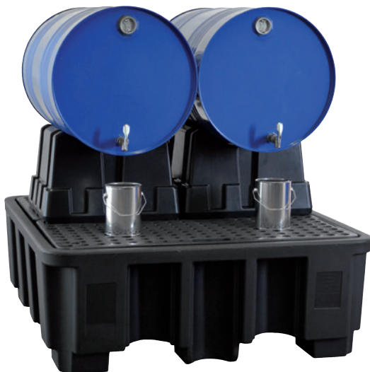
PE-200-3, Article no. P70-2026-A, with FB 2-Combi, Article no. P70-2033-A