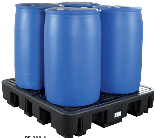
PE-200-4, with PE perforated plate, Article no. P70-2022-A