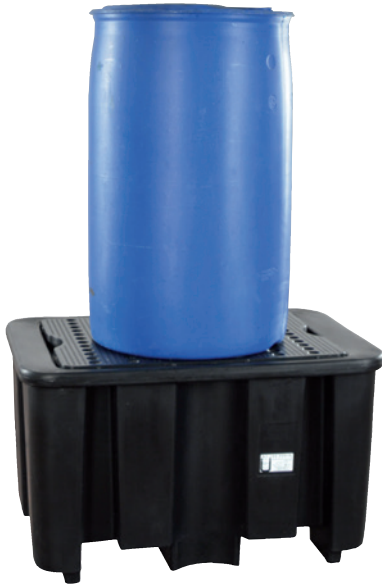
PE-200-1, with PE perforated plate, Article no. P70-2020-A