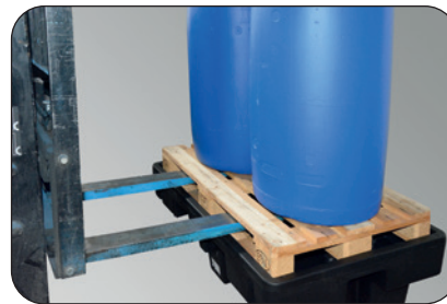
Safe positioning of the Euro pallet