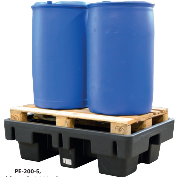
PE-200-5, Article no. P70-2024-A