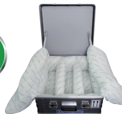
Transport box K 470 - Akku Safe, Article no. C62-2070-B