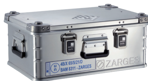
Transport box K 470 - Akku Safe Universal, Article no. C62-2071-B