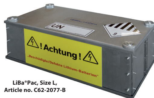
LiBa®Pac, Size L, Article no. C62-2077-B