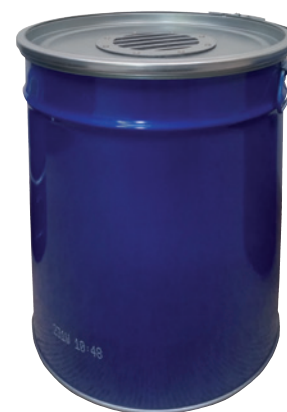
LiBa®Barrel, 50 liter, Article no. C62-2074-B