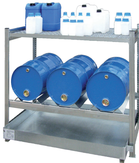
AR 1150 / 360 GR, Article no. R74-1052-A