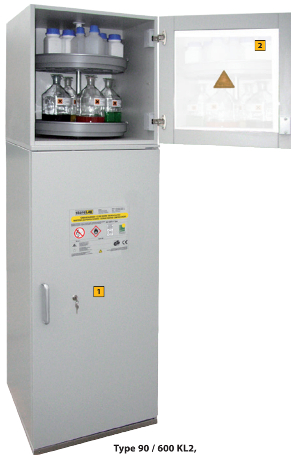
Type 90 / 600 KL2, Article no. B80-2889-A