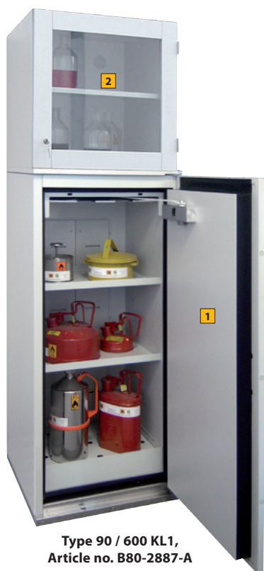
Type 90 / 600 KL1, Article no. B80-2887-A