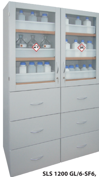
SLS 1200 GL/6-SF6, Article no. B80-3027-D