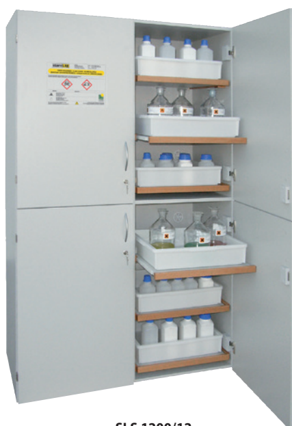
SLS 1200/12, Article no. B80-3016-D