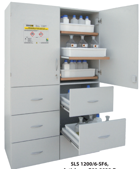
SLS 1200/6-SF6, Article no. B80-3025-D