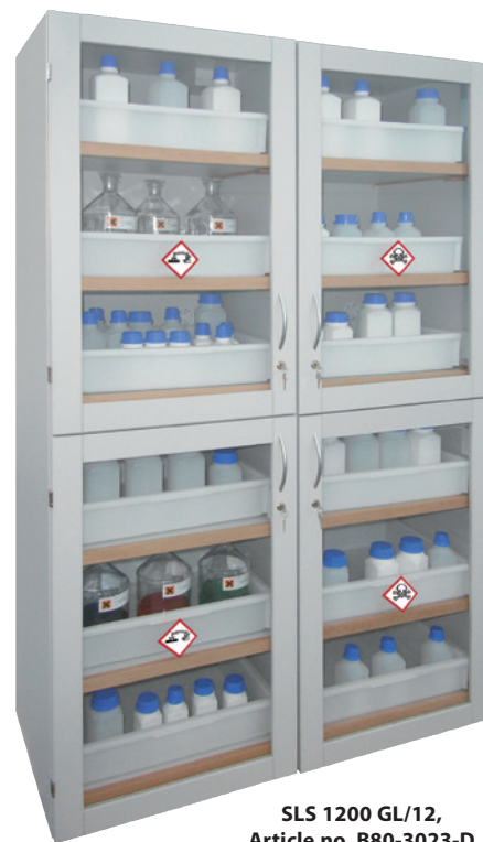
SLS 1200 GL/12, Article no. B80-3023-D