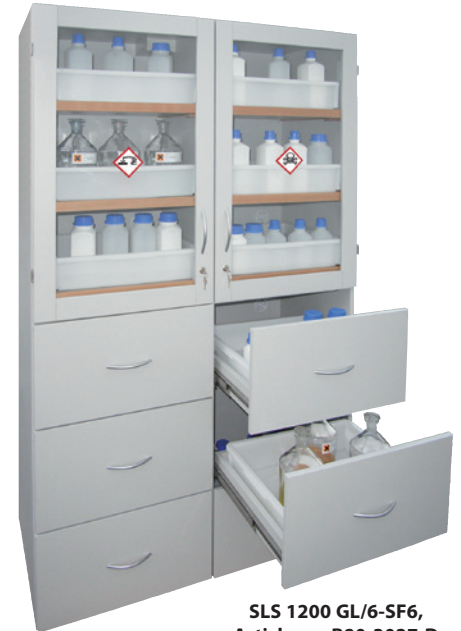
SLS 1200 GL/6-SF6, Article no. B80-3027-D