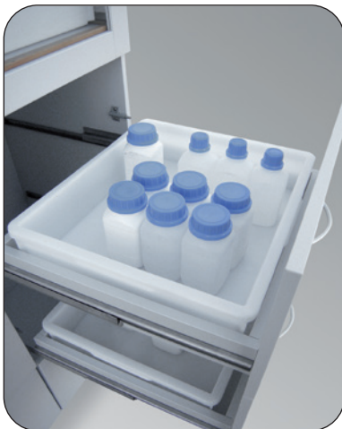
Pull-out drawer with end stop