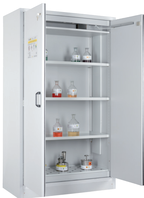
SIS Type 30/1200, Article no. B80-2600-A, doors RAL 7035 - light grey, incl. 3 shelves, base sump tray and perforated cover plate