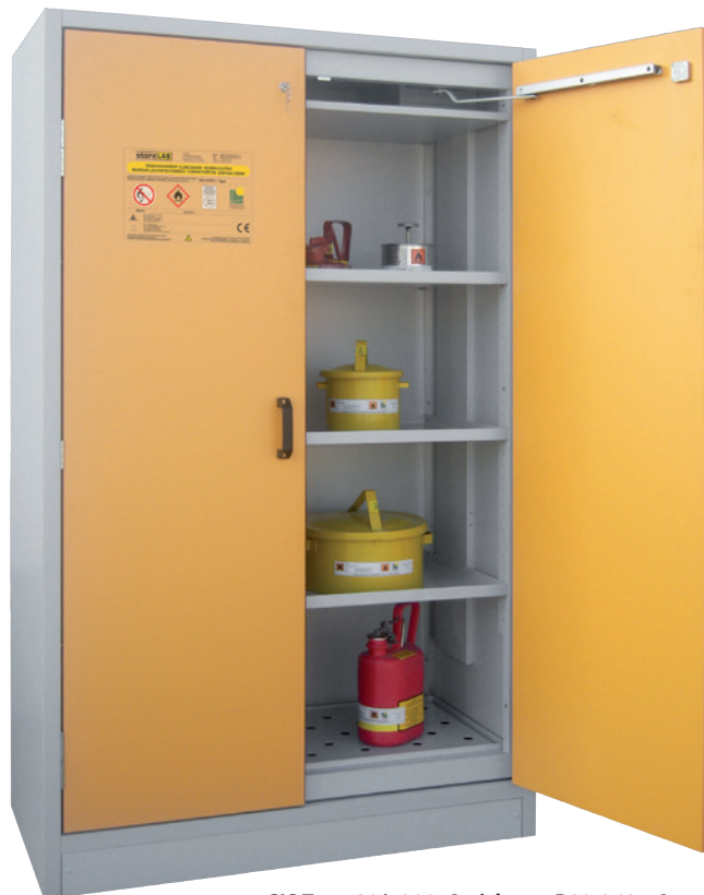
SIS Type 30/1200, Article no. B80-2604-A, doors RAL 1007 - daffodil yellow, incl. 3 shelves, base sump tray and perforated cover plate